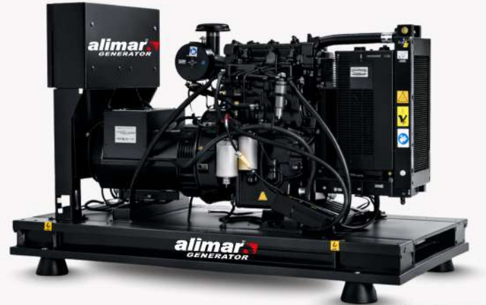
Visual representation only.

It is designed with a focus on power continuity, operational safety, and optimized fuel efficiency, ensuring stable and consistent performance across varying load conditions.