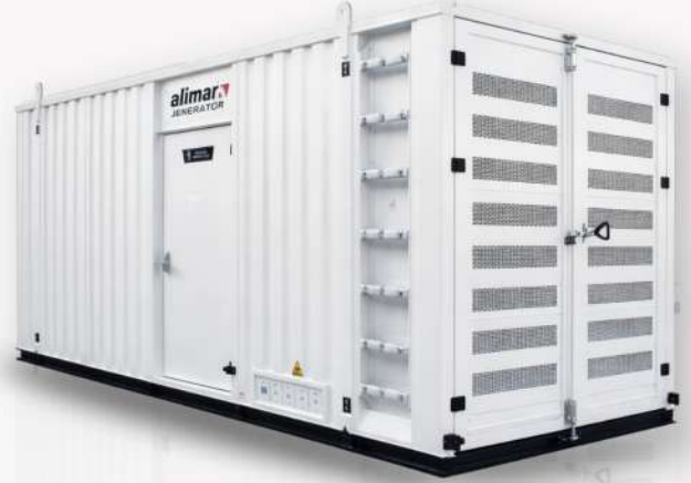
Görsel temsilidir. Visual representation only.

It is designed with a focus on power continuity, operational safety, and optimized fuel efficiency, ensuring stable and consistent performance across varying load conditions.