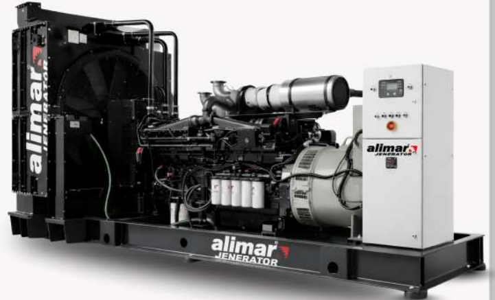
Visual representation only.

It is designed with a focus on power continuity, operational safety, and optimized fuel efficiency, ensuring stable and consistent performance across varying load conditions.