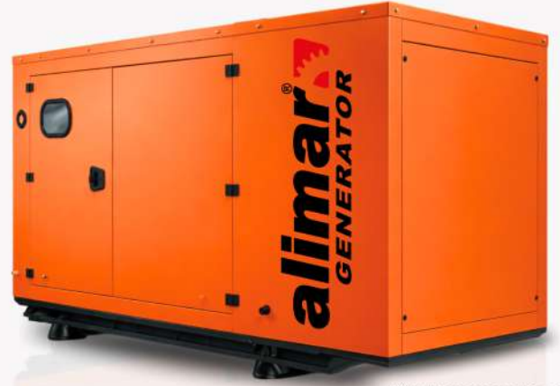
Visual representation only.

It is designed with a focus on power continuity, operational safety, and optimized fuel efficiency, ensuring stable and consistent performance across varying load conditions.