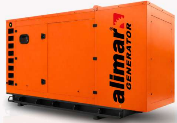
Visual representation only.

It is designed with a focus on power continuity, operational safety, and optimized fuel efficiency, ensuring stable and consistent performance across varying load conditions.