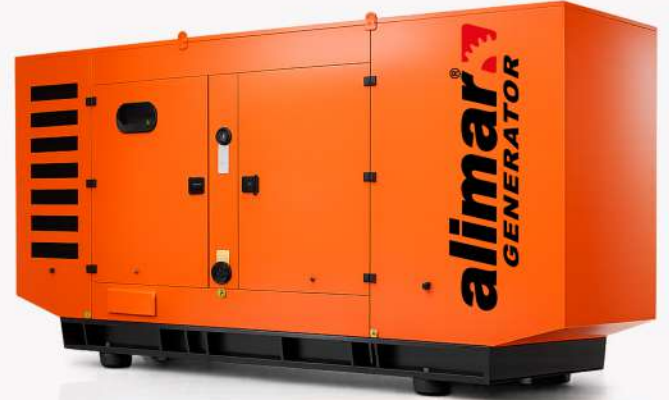
Visual representation only.

It is designed with a focus on power continuity, operational safety, and optimized fuel efficiency, ensuring stable and consistent performance across varying load conditions.