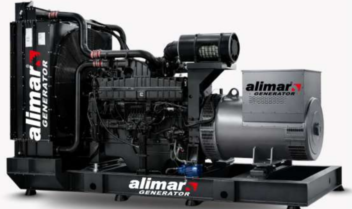
Visual representation only.

It is designed with a focus on power continuity, operational safety, and optimized fuel efficiency, ensuring stable and consistent performance across varying load conditions.