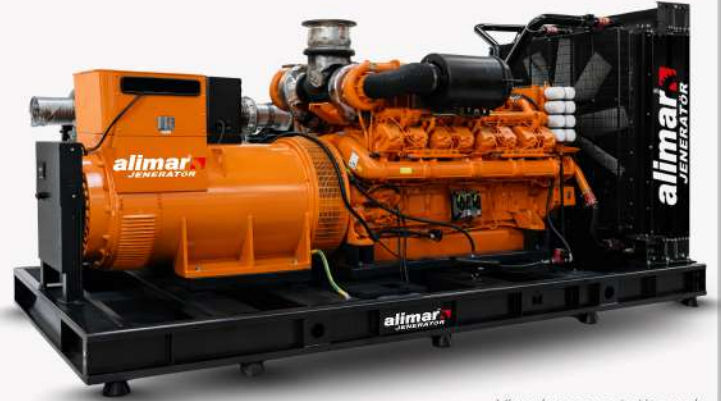
Visual representation only.

It is designed with a focus on power continuity, operational safety, and optimized fuel efficiency, ensuring stable and consistent performance across varying load conditions.