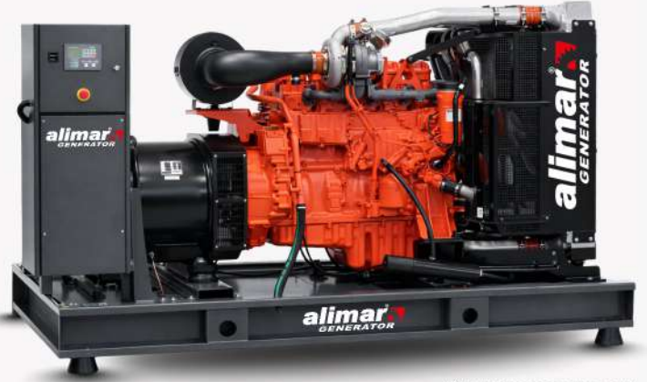
Visual representation only.

It is designed with a focus on power continuity, operational safety, and optimized fuel efficiency, ensuring stable and consistent performance across varying load conditions.