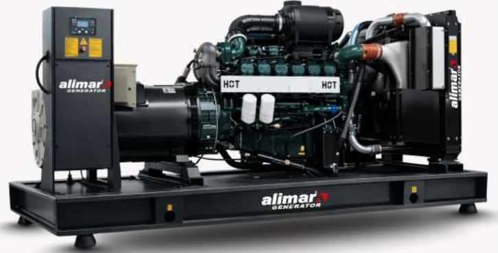
Visual representation only.

It is designed with a focus on power continuity, operational safety, and optimized fuel efficiency, ensuring stable and consistent performance across varying load conditions.