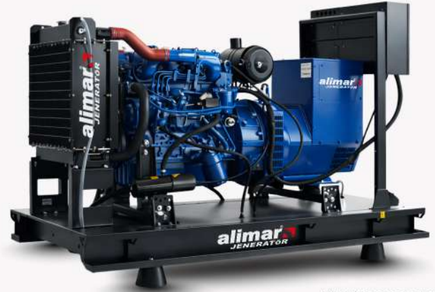
Visual representation only.

It is designed with a focus on power continuity, operational safety, and optimized fuel efficiency, ensuring stable and consistent performance across varying load conditions.