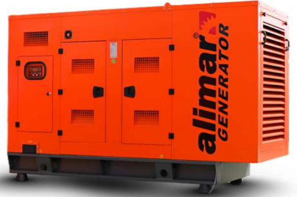
Visual representation only.

Alimar Generator continuously improves its products and reserves the right to update technical specifications, product configurations, and documentation without prior notice.