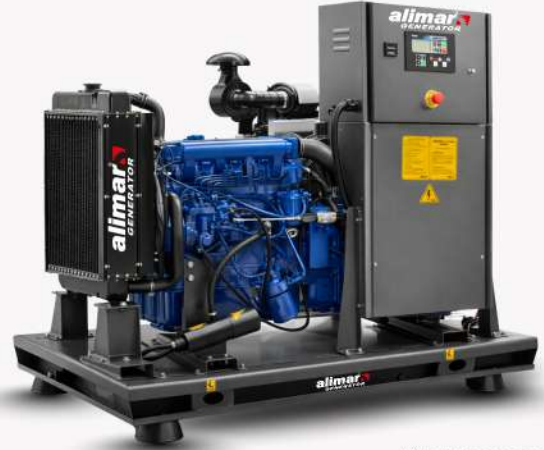
Visual representation only.

It is designed with a focus on power continuity, operational safety, and optimized fuel efficiency, ensuring stable and consistent performance across varying load conditions.