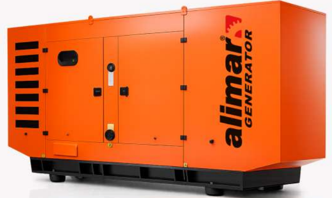
Visual representation only.

It is designed with a focus on power continuity, operational safety, and optimized fuel efficiency, ensuring stable and consistent performance across varying load conditions.