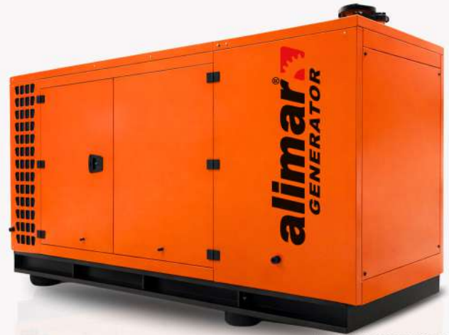
Visual representation only.

It is designed with a focus on power continuity, operational safety, and optimized fuel efficiency, ensuring stable and consistent performance across varying load conditions.