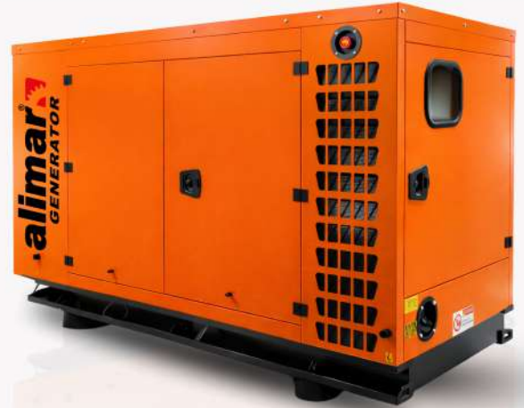
Visual representation only.

It is designed with a focus on power continuity, operational safety, and optimized fuel efficiency, ensuring stable and consistent performance across varying load conditions.