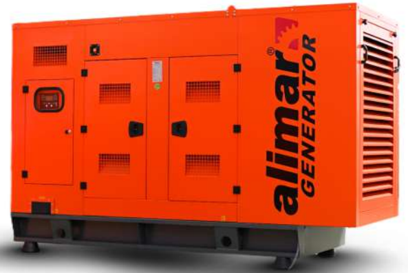
Visual representation only.

Alimar Generator continuously improves its products and reserves the right to update technical specifications, product configurations, and documentation without prior notice.