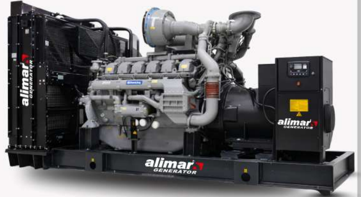
Visual representation only.

It is designed with a focus on power continuity, operational safety, and optimized fuel efficiency, ensuring stable and consistent performance across varying load conditions.