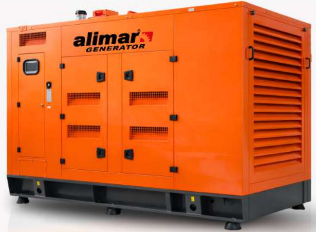
Visual representation only.

It is designed with a focus on power continuity, operational safety, and optimized fuel efficiency, ensuring stable and consistent performance across varying load conditions.